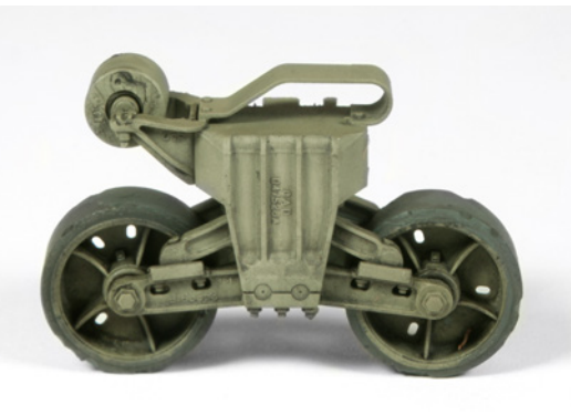
Applying the Dust & Dirt deposits will bring some color in your model.