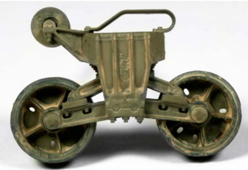
This process can be repeated until you are satisfied with the result.

It can also be used to outline the model to create dust effects around the details.