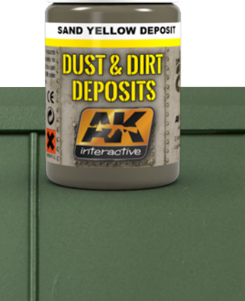
Use this product to recreate accumulated dust on your model.