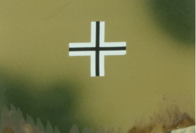
Shake before use and apply the products directly