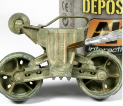
Apply the product in the desired places and let it set for about 10 minutes.