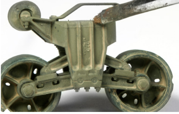
Blend in the paint with a moist flat brush. You should actually push the paint there where it needs to be. Don't forget to clean the brush frequently.