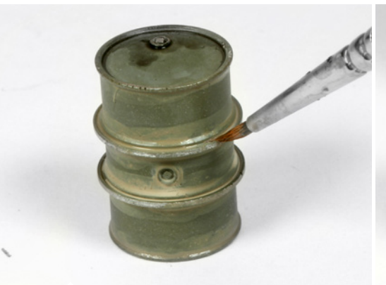
Paint on the product directly from the jar.