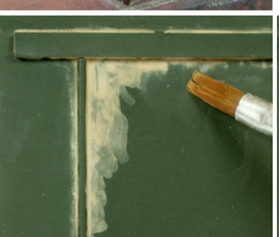
Use a flat brush moist with White Spirit and blend in the paint proximally 10 minutes after it is applied.