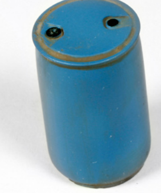
This easy to use enamel paint has a light textured effect when dry. Perfect to recreate accumulated dust.