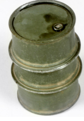
Blend in the enamel paint after it has dried for about 10-15 After is has completely dried you create a nice built up dust effect due to minutes. After is has completely dried you create a nice built up dust effect due to the fine texture in the paint. Repeat if you want more stronger effects.