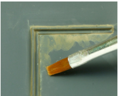
Use a flat brush moist with White Spirit and blend in the paint proximally 10 minutes after it is applied.