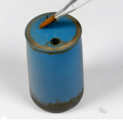
Moist a flat brush with White Spirit and blend in the