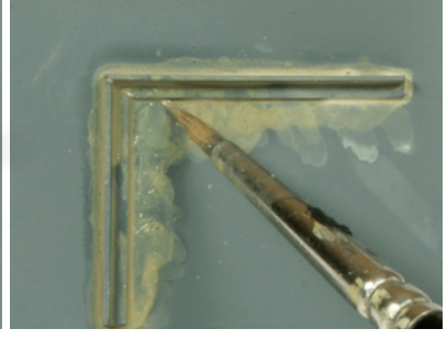
Shake before use and apply the products directly