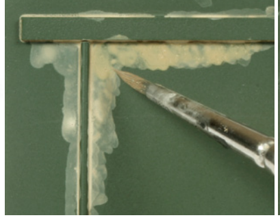
Shake before use and apply the products directly