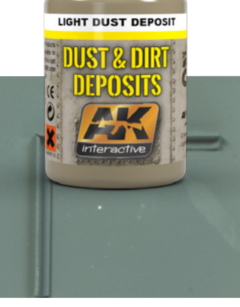
Use this product to recreate accumulated dust on your model.