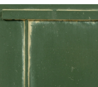
Due to the very fine texture of the paint the result is a perfect simulation of built up dust or dirt