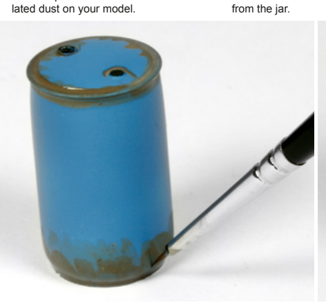
Shake before use and apply onto the desired areas and let it dry for about 10-15 minutes.